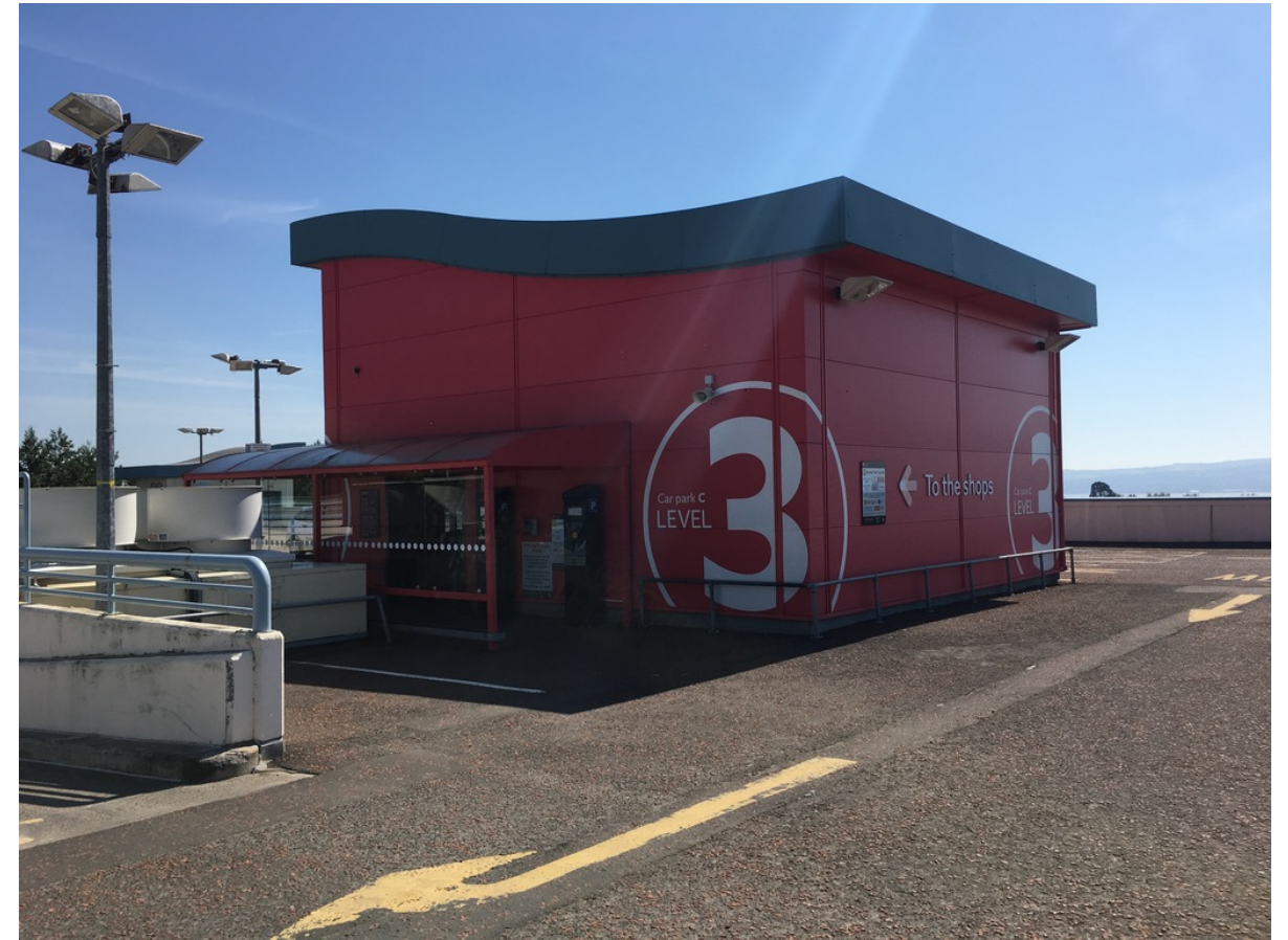
Car Park C - Level 3 is the roof top Car Park. It has a pink coloured foyer with both lift and stair access to the mall.