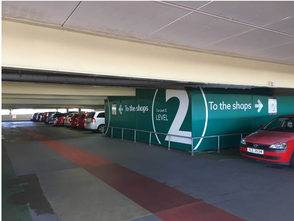
Car Park C - Level 2 is the undercover Car Park. It has a green coloured foyer with both lift and stair access to the mall.