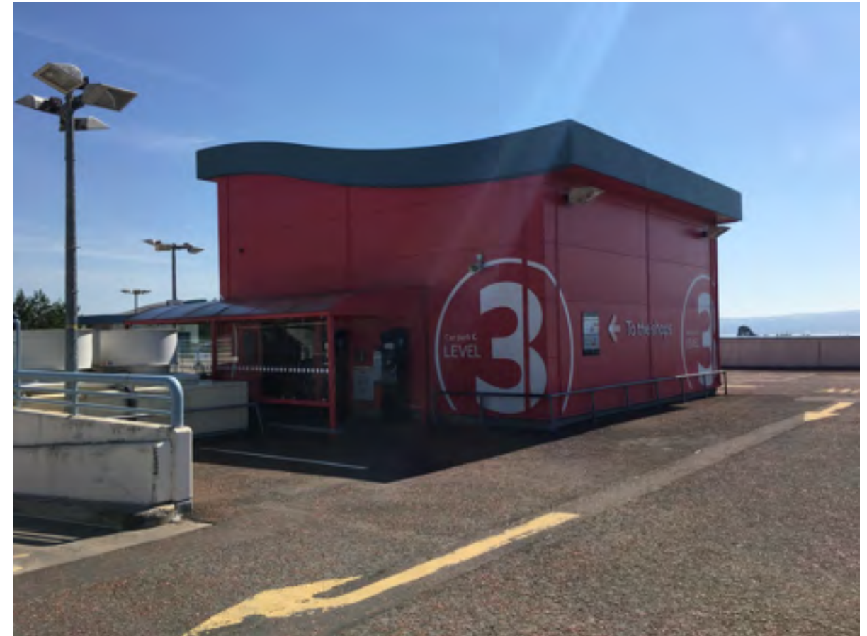
Car Park C - Level 3 is the roof top Car Park. It has a pink coloured foyer with both lift and stair access to the mall.