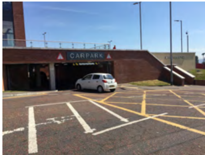
Next / Dunnes Stores Entrance