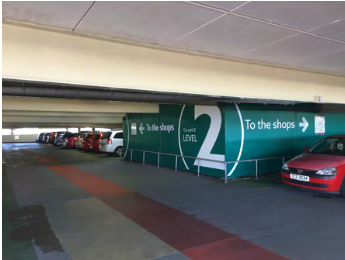
Car Park C - Level 2 is the undercover Car Park. It has a green coloured foyer with both lift and stair access to the mall.