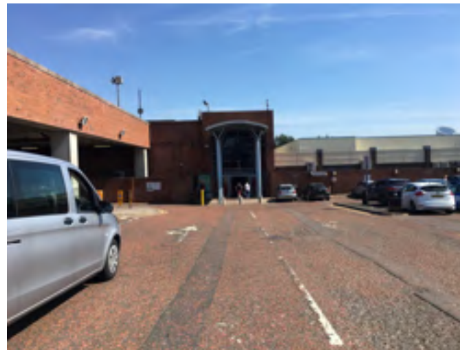
CEX / Synge & Byrne and Main Entrance