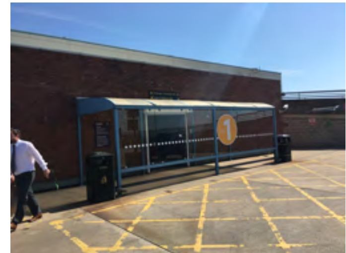
Entrance leading to Superdrug

Each Car Park in Abbey Centre is well signposted on arrival but here are a few additional photographs.