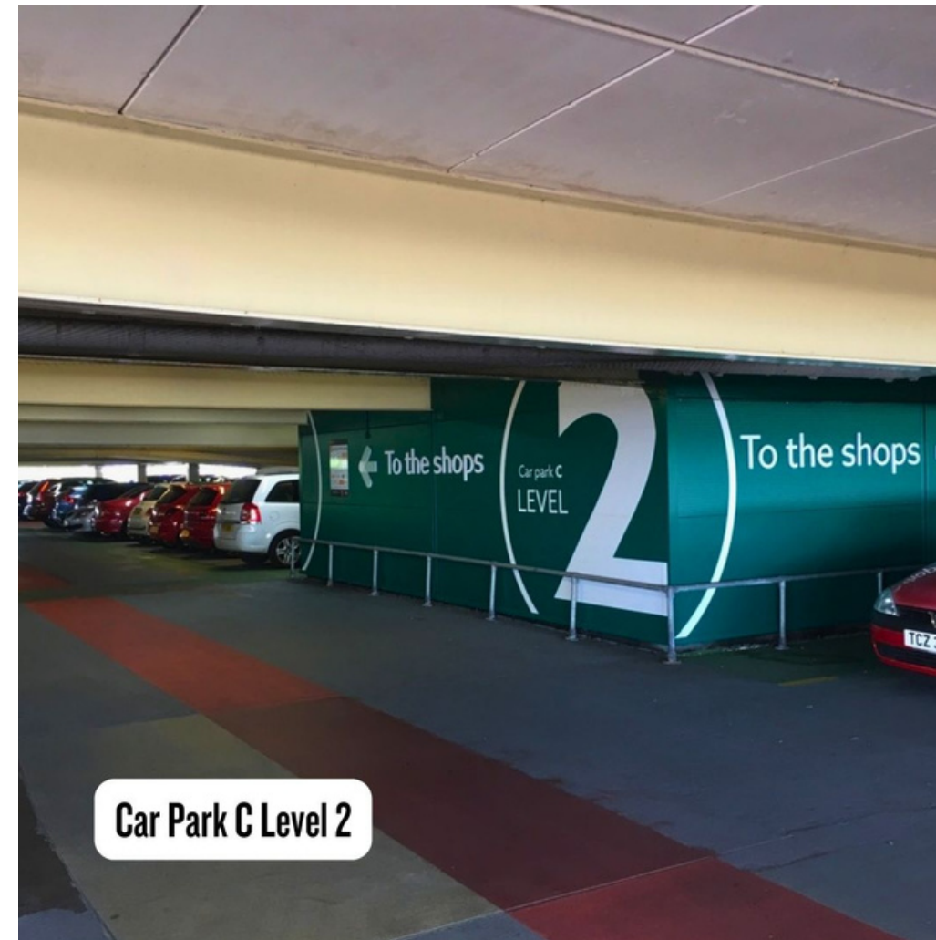
Car Park C Level 2

Car Park C - Level 2 is the undercover Car Park. It has a green coloured foyer with both lift and stair access to the mall.