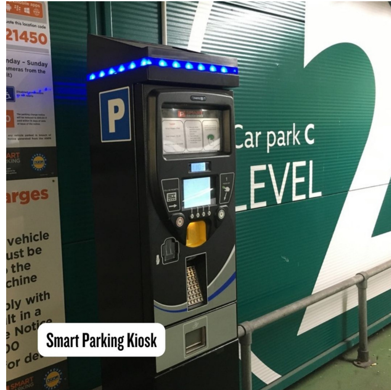
Smart Parking Kiosk

If you are planning to shop in Abbey Centre for over 4 hours, you can park your car in Car Park C Level 1 and pay £1.50 using the Car Parking Machine.